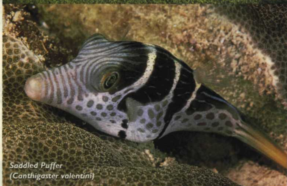
Saddled Puffer ( Canthigaster valentini )