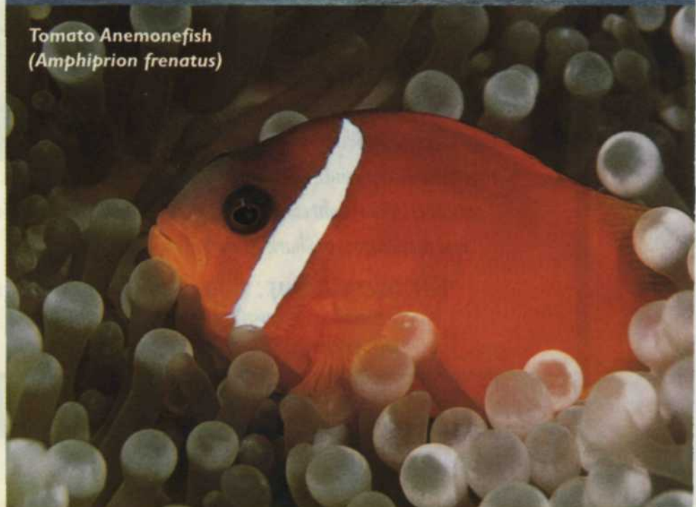
Tomato Anemonefish ( Amphiprion frenatus )