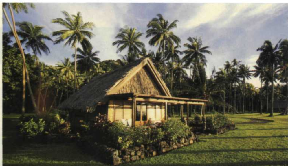
A private bure facing the sea.

Fiji Forbes is an all-inclusive resort, which means everything is included in one tariff. All your food, drink, laundry services, diving and deepsea fishing are included in the pack-